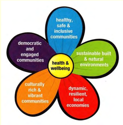
FIVE DOMAINS OF WELLBEING