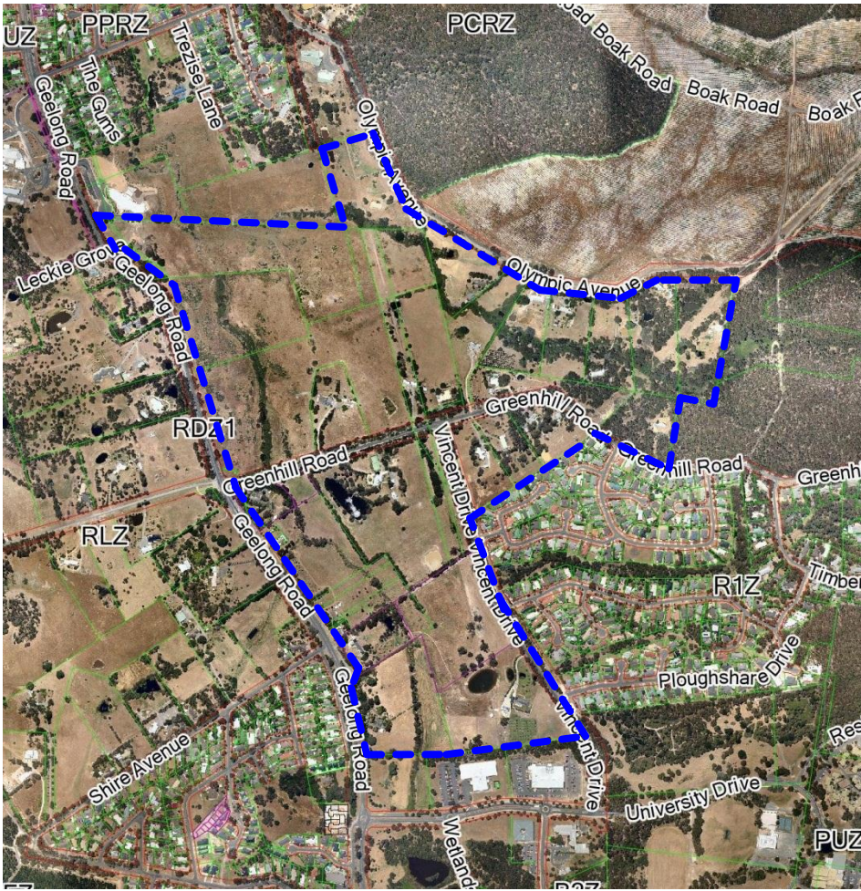
Greenhill Road Development Feasibility Study area aerial image