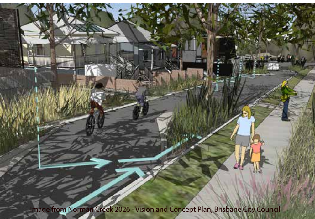
Image from Norman Creek 2026 - Vision and Concept Plan, Brisbane City Council